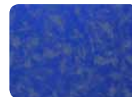
PPS 31 light blue