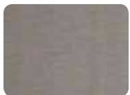
F12PPS stainless steel-like