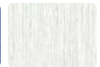
PPS3 lined white